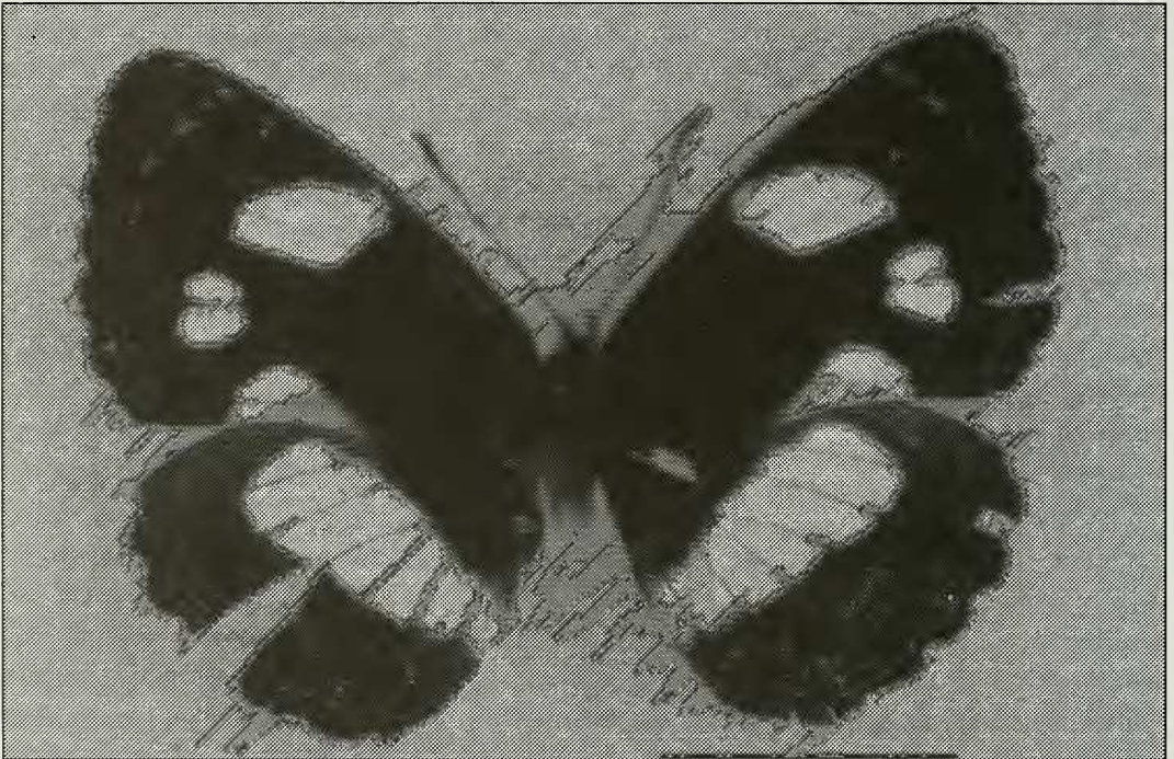
Plate A. Neptis marci sp. nov. Holotype male (upperside). Butuohe, Kivu, Zaïre, 2000 m, vii.1987 (S.C. Collins – in African Butterfly Research Institute (ARRI), Nairobi).

smaller, fused double spot in spaces 2 and 3. There is a third group of fused spots in spaces 5-8, not quite reaching the costa. The three groups are better separated than in other species with such a pattern. The cell is unmarked. The shape of the forewing is more squat than in most Neptis . On the hindwing there is a white discal band from space 1a to space 6, broadening considerably towards space 5, as in N. lugubris . On all four wings the white markings are of the intense white typical of montane species and the usual submarginal white lines of the upperside are almost obsolescent.